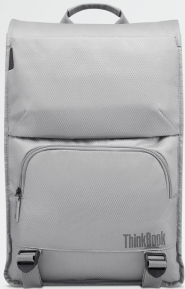
THINKBOOK URBAN BACKPACK PN: 4X40V26080

A multi-functional backpack with anti-theft pocket ensures security on the move. The padded PC compartment offers cushioned comfort and protection for your laptop. High-quality fabric and stylish PU leather accent add to the contemporary design.