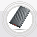
Lenovo PS6 Portable SSD