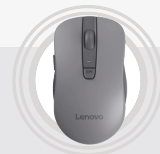
Lenovo WL310 Bluetooth Silent Mouse