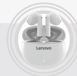
Lenovo E310 True Wireless Stereo Earbuds