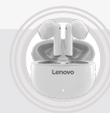
Lenovo E310 True Wireless Stereo Earbuds