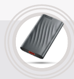
Lenovo PS6 Portable SSD