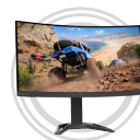
Legion Y27h-30 Monitor