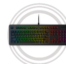
Legion K310 RGB Gaming keyboard