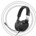
Lenovo Ideapad Gaming H100 Headset