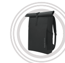
Lenovo IdeaPad Gaming Modern Backpack