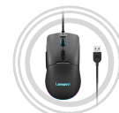
Lenovo M210 RGB Gaming Mouse