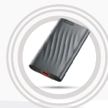
Lenovo PS6 Portable SSD