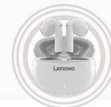
Lenovo E310 True Wireless Stereo Earbuds