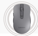
Lenovo WL310 Bluetooth Silent Mouse

* Example of Lenovo catalogue naming convention